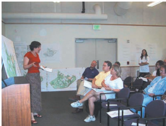
Master planning is participatory, involving workshops with community and staff.