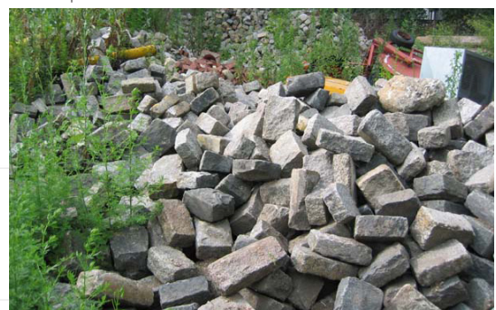
Cobbles, which originally served as ballast on ships and then as pavers on city streets, will be reused as pavement edging along walks and terraces.