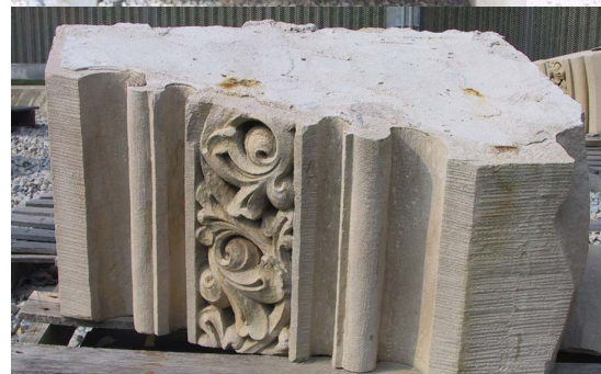
Portions of the Gothic arch and the Cornerstone to Ashbury Methodist Episcopal Church, which burned down in 1997, will be reused in the Rain Garden to evoke West Philadelphia's past history.