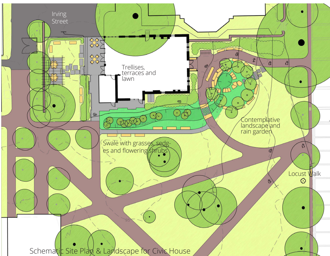
Schematic Site Plan & Landscape for Civic House