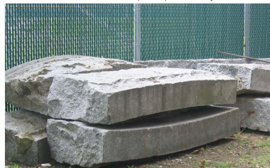
Granite curbs from city streets will be reused as curbs, benches and steps in the contemplative landscape at Civic House.