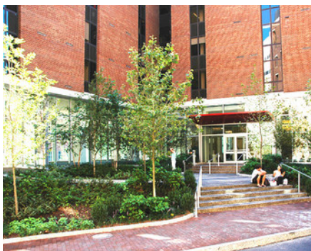
Opposite: Pennsylvania State University Student Housing, Abington, PA