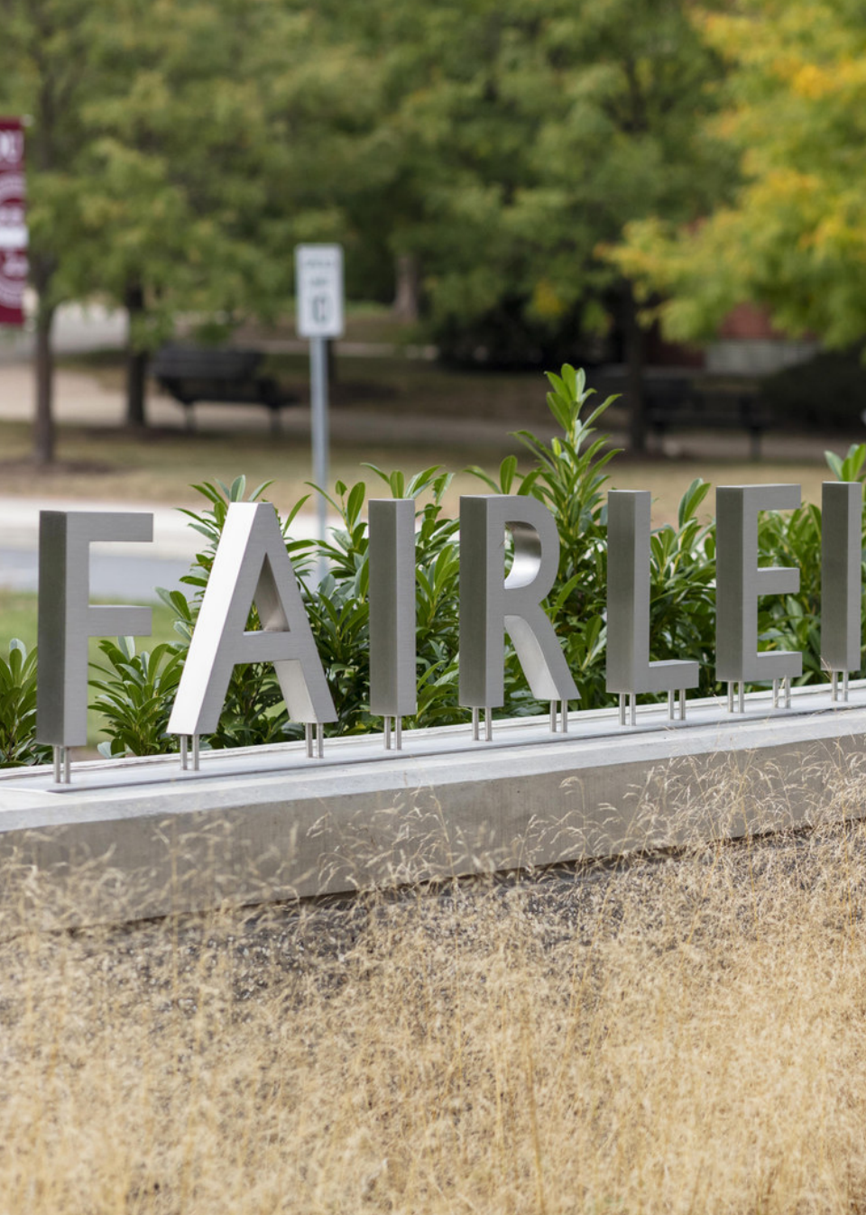
Fairleigh Dickinson University, Hackensack, NJ