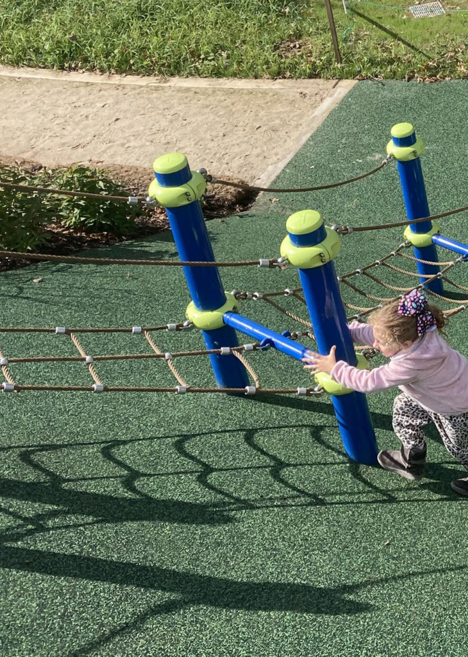
Lions Pride Park Playground, Warrington Township, PA