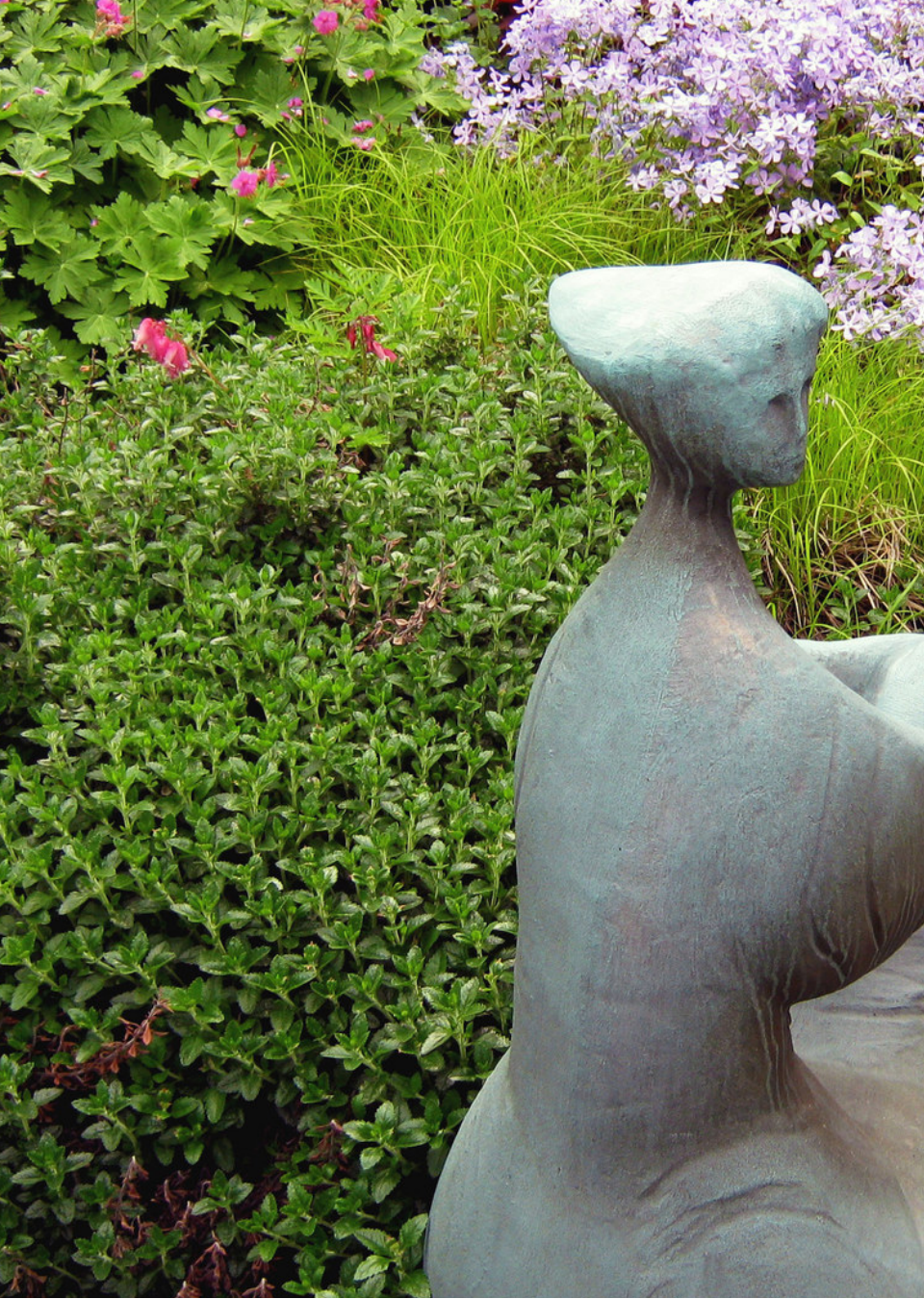
University of Pennsylvania School of Nursing Roofgarden, Philadelphia, PA