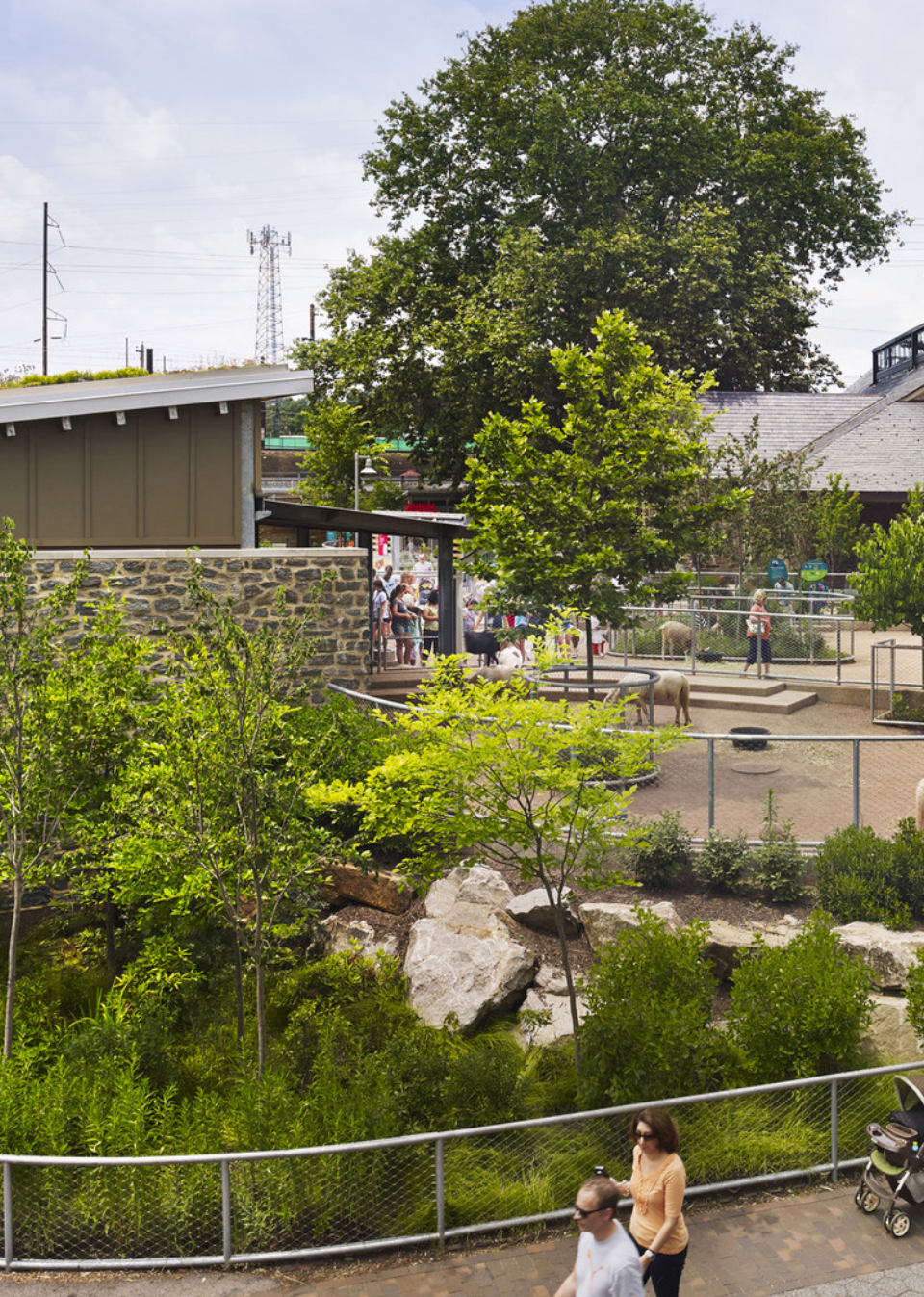
KidZooU at The Philadelphia Zoo, Philadelphia, PA