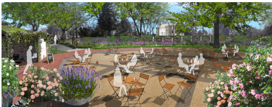
Opposite & Top left: The Schuylkill Center for Environmental Education, Philadelphia, PA Bottom: The Woodlands Cemetery, Philadelphia, PA