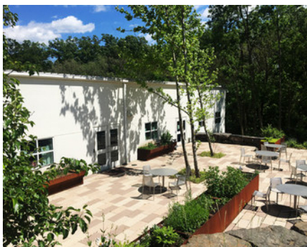
Opposite: Sisters of the Immaculate Heart of Mary Motherhouse, Monroe, MI Top left: Upper Merion Community Center, King of Prussia, PA