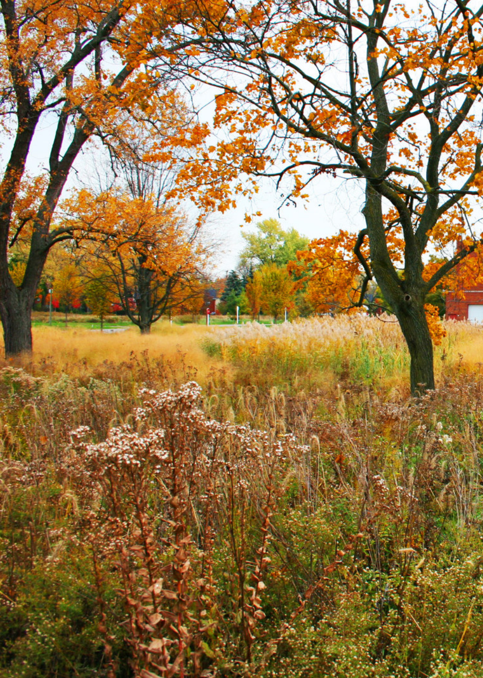
Sisters of the Immaculate Heart of Mary Motherhouse, Monroe, MI